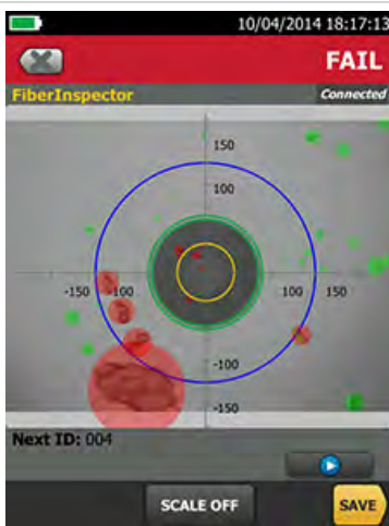
Defects that fail the standard's requirements are colored Red

FiberInspector Pro highlights defects found on fiber end-faces. Instead of just coloring the defect area, the FI-7000 colors the defect and highlights the defect's background so that the defect is clearly visible. Defects that fail the standard's requirements are colored Red, while defects that pass are colored Green.