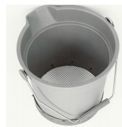
190-E20 Wash Bucket - Custom mesh sizes available