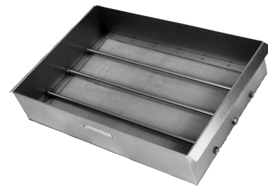
188-E10 Wash Frame, Complete